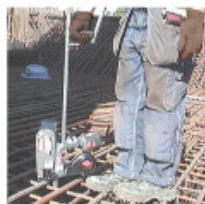
Extension bar (Option)