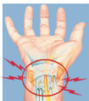
Carpal tunnel syndrome

Just pulling the trigger. The simple operation reduces potential wrist damage such as carpal tunnel injuries. Using the optional extension bar reduces the risk of back injuries.