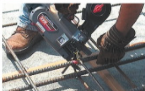
COMMERCIAL BUILDINGS / FOUNDATIONS / ROAD CONSTRUCTION / BRIDGES PRECAST PLANTS / RADIANT HEATING TUBES